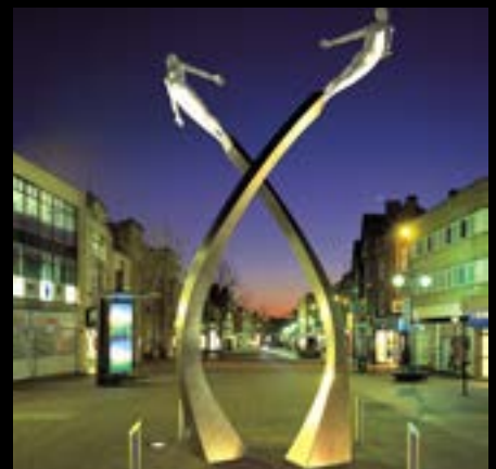
Discovery - Northampton