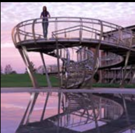
Skyramp - Birmingham