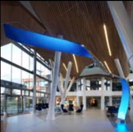
The Swarm - O2 HQ