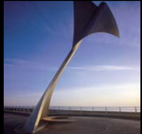
Wind Shelter - Blackpool