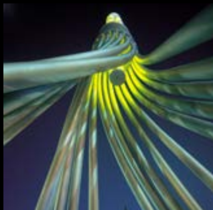
The Braid - Blackburn