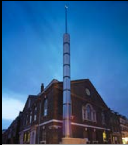
Minaret - Brick Lane, London