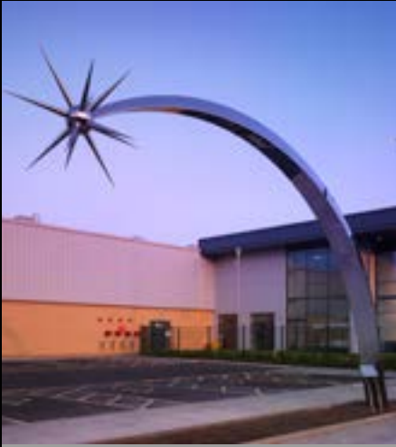
Air Burst - BAE Systems HQ