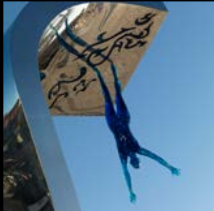
The Wave - Blackpool