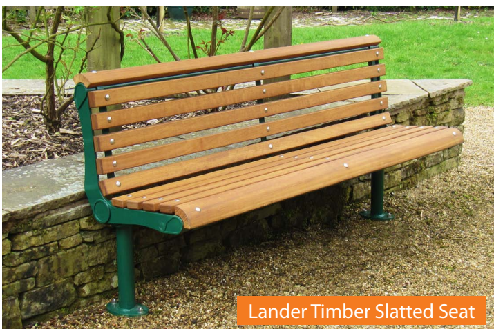
Lander Timber Slatted Seat

We also recently added the Lander Timber Slatted Seat to our standard street furniture range. Like some of our other timber slatted seats, the Lander features a mild steel frame and hardwood slats made from renewable sources and has been designed for comfort, style and durability.