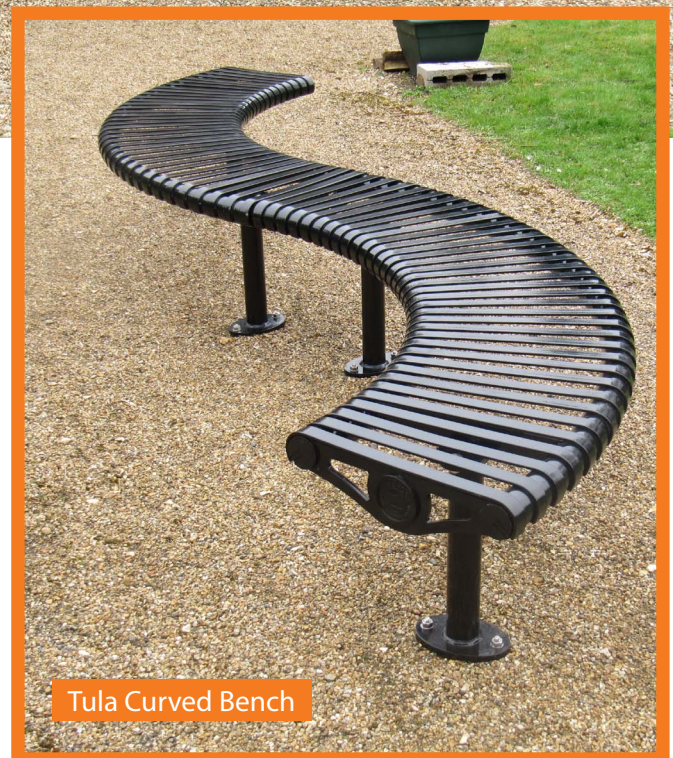
Tula Curved Bench

The length and product options essentially make the curved seating a bespoke street furniture solution for any urban project or as a one-off. Both the seats and benches are available as mild steel in a choice of RAL colours or as satin polished stainless steel.