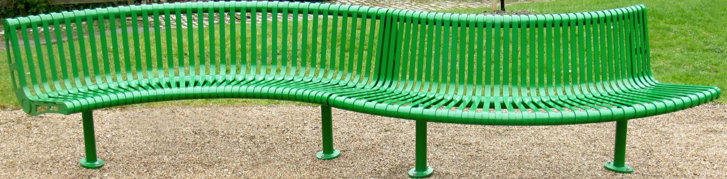
Tula Curved Seat

We are pleased to announce that we have expanded the Goose Foot Street Furniture range and introduced some fantastic new seating concepts.