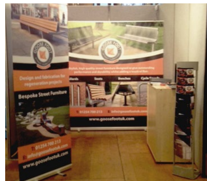
Goose Foot stand at Regen 2015 in Liverpool.

One of the latest projects from Goose Foot included 10 bespoke seats for Colwyn Bay in Wales, a contract that came in the back of our attendance to the previous Regen conference.