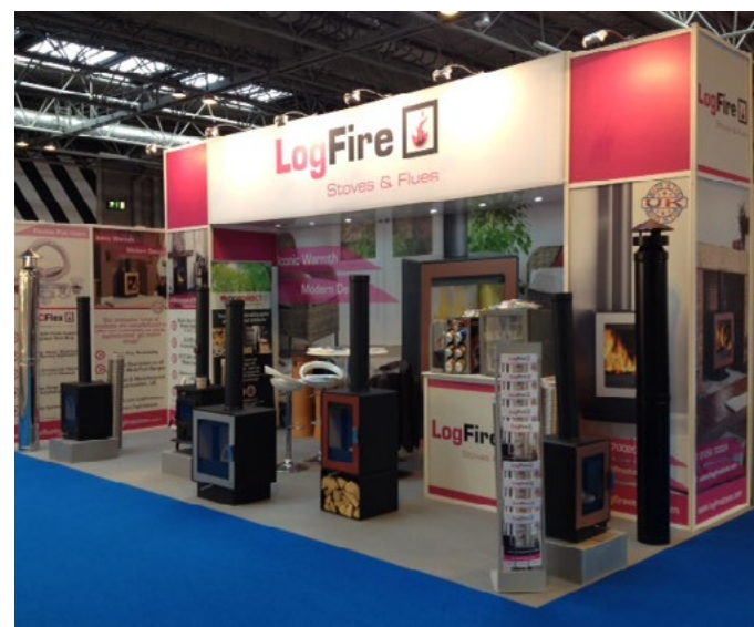
LogFire stand at the Homebuilding & Renovating Show 2015 at the NEC in Birmingham

Our LogFire division is continuing to take the stove and flue market by storm, and after a last minute offer, the team exhibited at the Home Building & Renovating Show at the NEC in Birmingham. The four day show hosts thousands of visitors each day and the exhibition had some promising results from building contractors, home owners and many more.