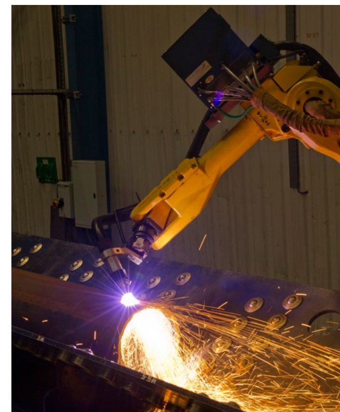
We now also have plasma tube cutting capability of up to 8m x 1000mm dia x 40mm wall thickness!

"Adding MTL to our family is a logical move for us and for MTL and we look forward to the future with confidence."