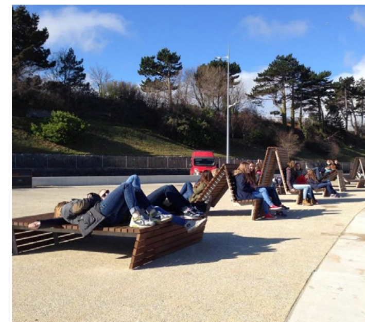
Sitting pretty: The new seats have caught the eye of visitors