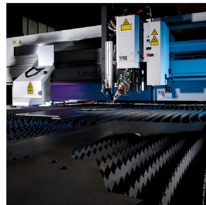
Now available: Large laser cutting up to 20m long x 3.2m wide x 20mm thick with bevel capability of up to 45 degrees!

In addition, MTL house one of the largest waterjet machines in the country, with a 12m x 3m bed which complements our current set up in Blackburn. Its 2 high definition plasma cutters can cut profiles up to 25m x 5m with bevel capability to 40 degrees, and they've also got a tube cutter which can cut up to 1000mm dia. and 40mm thickness.